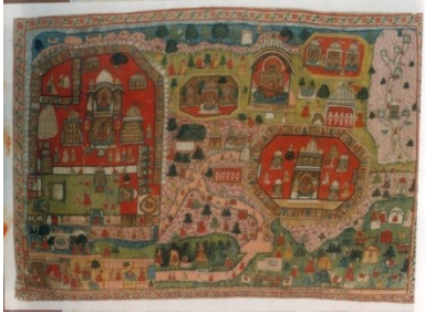
Figure 6: Calculated frequency evolution of modes detected in the BLS spectra.

In Fig. 6 the calculated frequencies of the most representative eigenmodes at +500 Oe (FM state) and - 500 Oe (AP state) are plotted as a function of the gap size d between the Py and Co sub units (please remind that in the real sample studied here, d = 35 nm). As a general comment, it can be seen that the frequencies for the system in the AP state are more sensitive to d than those of the P state. In particular, the lowest three frequency modes of the AP state (EM(Co), EM(Py) and F(Py)) are downshifted with respect to the case of isolated elements (dotted lines) and show a marked decrease with reducing d , while the two modes at higher frequencies (F(Co) and 1DE(Py)) have an opposite behavior even though they exhibit a reduced amplitude. In the P state (right panel), the modes concentrated into the Py dots exhibit a moderate decrease with reducing d , while an opposite but less pronounced behavior is exhibited by the F(Co) mode.