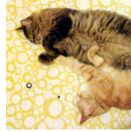
Figure 2: MFM images of the bi-component Py/Co dots for different values of the applied magnetic field which are indicated by greek letters along both the major and minor hysteresis loop.

To directly visualize the evolution of the magnetization in the Py and Co subunits of our bi-component dots during the reversal process, we performed a field-dependent MFM analysis whose main results are reported in Fig. 2. At large positive field ( H = +800 Oe, not shown here) and at remanence ( \alpha point of the hysteresis loop of Fig. 1), the structures are characterized by a strong dipolar contrast due to the stray fields emanated from both the Py and Co dots.