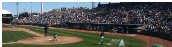
Figure 1: MOKE hysteresis loop for the bi-component Py/Co dots array measured along the dots long axis.

WOODSTOCK'97, July 2016, El Paso, Texas USA © 2016 Copyright held by the owner/author(s). 123-4567-24-567/08/06... $15.00 DOI: 10.1145/123_4